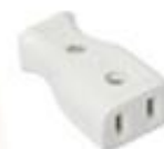
Socket for connecting by exhibitors per unit of 100W.