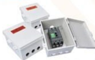
Circuit Breaker Three Phase 380V. 50Hz.