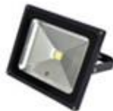
Floodlight LED 50W. 220V. Warm Light (LED)