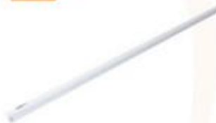
Fluorescent Light 1.2 m. 14W. (LED)