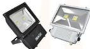
Floodlight 100W. 220V. Day Light (LED)