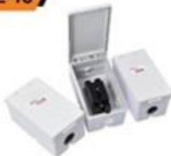
Circuit Breaker Single Phase 220V. 50Hz.