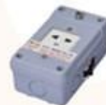
Socket 5 Amp (5 Amp fuse) 220V. 50Hz. (Not For lighting)