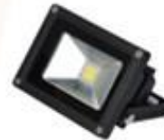
Floodlight LED 30W. 220V. Warm Light (LED)