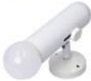
Spotlight 9W. standard (LED)