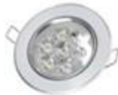
Down Light 7W. (LED)