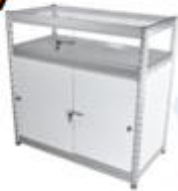
Counter Showcase 60X100X100 cm.