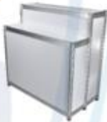
2 - Tier Counter 50X100X100 / 120 cm.