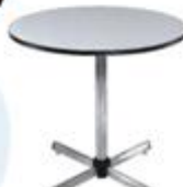
Round Table 75X75X75 cm.