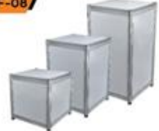
Display Stand 50X50X50 / 75 / 100 cm.