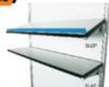
Wall Shelf 25X100 cm.