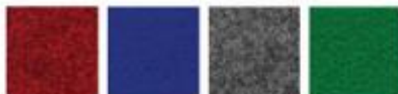
NEEDLE PUNCH CARPET RED/BLUE/ GREY/ GREEN