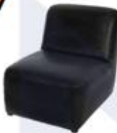
Lounge Chair (Sofa) 60X80X45 / 70 cm.