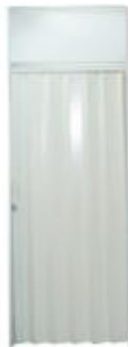
FOLDING DOOR 100-200 CM (SYSTEM BUILT)