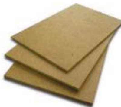
WOOD PLATFORM WITHOUT CARPET