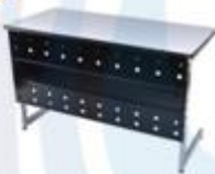
Receptionist Desk 60X120X75 cm.