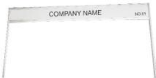
FASCIA BOARD WITH STANDARD LETTERING 10CM HIGH 10000 CM