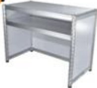
Counter 50X100X75 / 100 cm.