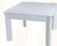
Coffee Table 65X85X40 cm.