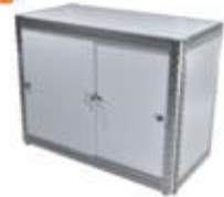
Lockable Cabinet 60X100X75 cm.